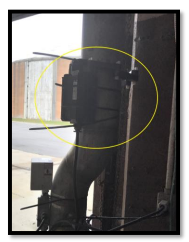
Figure 3: Location of the installation point and pipe bypass (left) and installed HydroFLOW device (right)