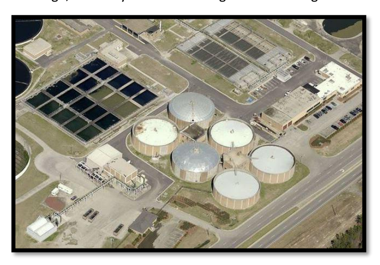
Figure 2: The J. B. Messerly Water Pollution Control Plant

The WPCP (see Figure 2) is one of four wastewater treatment plants that serve the City of Augusta's service population. It is managed, operated, and maintained by the City's Water and Sewer Department. The WPCP, designed for 46 mgd, currently treats an average flow of 20 mgd.