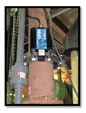
Figure 1: Installed HydroFLOW unit (Model 160i) at a wastewater treatment plant

The Hydro FLOW I Range is powered by the patented Hydropath technology. When properly installed on a pipe (see Figure 1), it induces a 150 kilohertz, oscillating sine wave, alternating current (AC) signal. The electric induction is performed by a special transducer connected to a ring of ferrites. The pipe and the flowing fluid act as a conduit, which allows the signal to propagate. The induced AC signal is believed to cause the mineral ions that make up struvite (magnesium, ammonium, and phosphate) to form loosely held together clusters. When certain conditions are created (e.g., pressure change, temperature change, and turbulence) the clusters precipitate out of solution and form stable crystals of struvite that remain in suspension. The crystals are not able to adhere to surfaces as hard scale and are carried away with the flow. Because hard scale no longer accumulates, the shear forces created by the flowing liquid erode and soften existing scale deposits over time. It is important to note that constant liquid flow is required to remove hard scale deposits from a system.