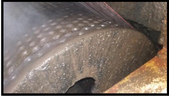
Figure 5: Final condition on 1st March 2018

In addition to test observations, it is also important to note anecdotal information concerning the operators experience using HydroFLOW :