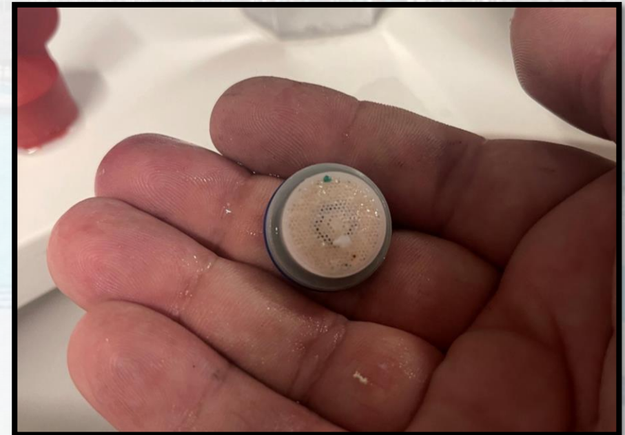
Faucet aerator with negligible debris