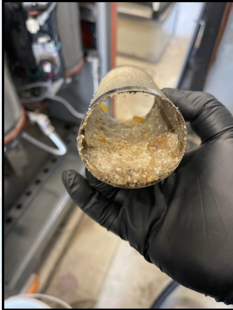
Hard limescale in the water heater's strainer

Prior to the installation of two HydroFLOW i100 units, the hotel was forced to provide discounts on rooms, and in some cases full refunds, due to very low water pressure and lack of hot water.