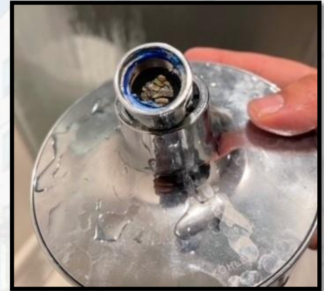
Limescale chunks in showerhead