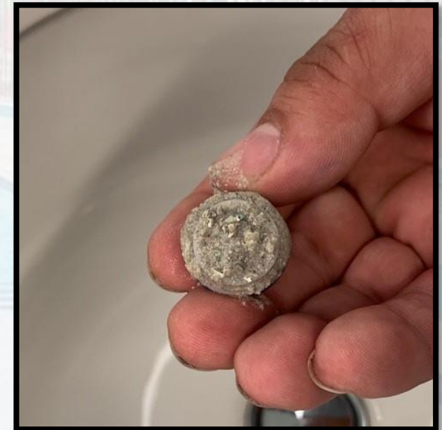
Plugged-up a faucet aerator