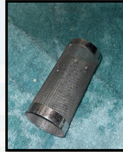
Clean strainer during routine maintenance