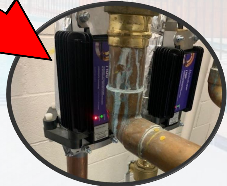
Tankless water heaters and HydroFLOW devices