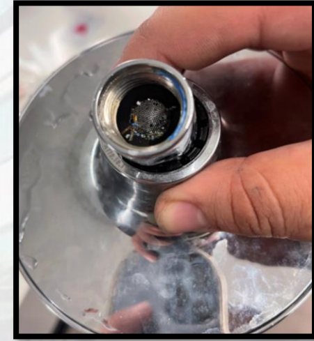
Showerhead with a little debris