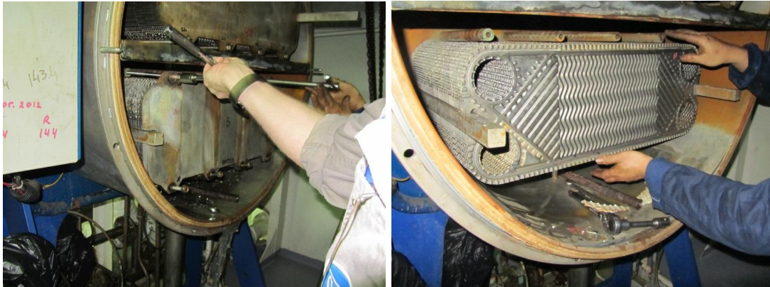
Figure 8. FWG is opened and cover is removed. Water released is clear.