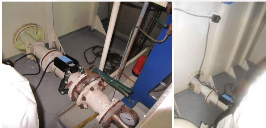
Figure 6. Left: System installation location. Right: System connected to an EJB connection.

The HydroPath MARINE system was installed on a 4" pipe, providing sea water to the FWG approximately 1 meter before the inlet to the FWG. The system was installed slightly backwards from where it should have been placed, in order to protect it from wetness whilst opening the FWG. The system is connected to an EJB connection / junction box as seen on figure 6. The EJB connection / junction box is connected to the main power cabinet of the FWG (see figure 7).