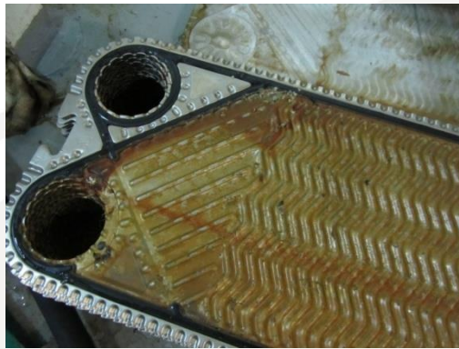
Figure 3. FWG plates covered with slime.