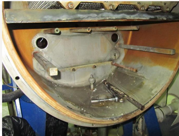
Figure 12. June 2013 - FWG chamber (where plates are mounted) treated with a HydroPath MARINE system, without any lime scale or slime.