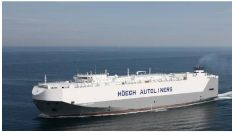
Figure 1. MV Hoegh America.