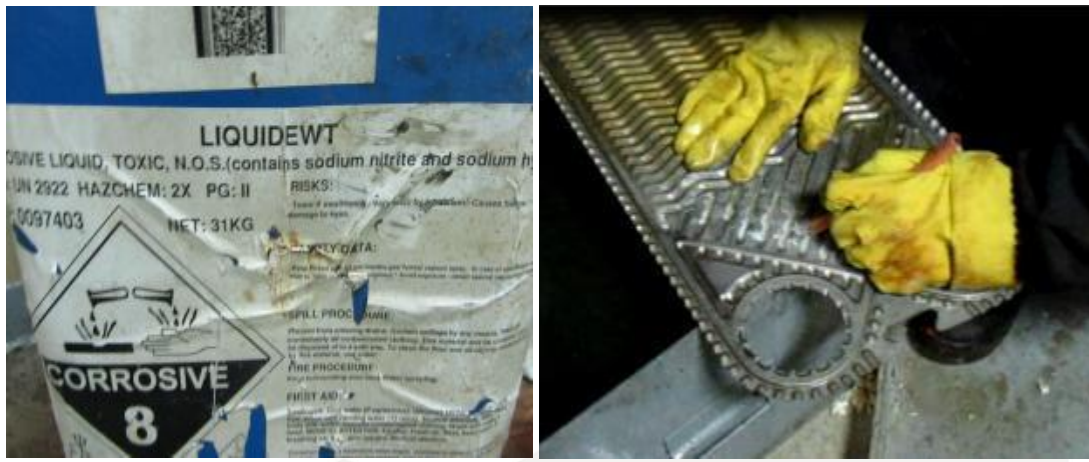
Figure 5. Left: Chemical used to soften lime scale. Right: Carving out lime scale.