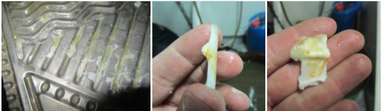
Figure 2. Lime scale precipitation on the titanium heat exchanger plates prior to the installation.

On the day of installation, the FWG was opened, although its indicator did not show any reduction of water production. Last opening and cleaning was conducted during May 2012. The FWG was treated with chemicals (Liquidewt) on a regular basis by a dosing pump, as instructed by the ship managers. Despite that, on most plates of the heat exchanger it was found that there was a buildup of lime scale which was up to 3 mm thick (figure 2).