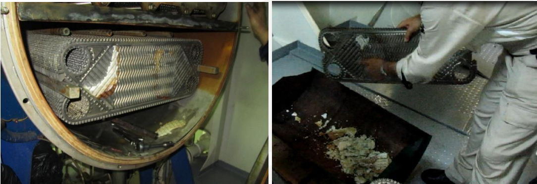
Figure 9. Some plates had limescale on them, but it was easily removed by hand.