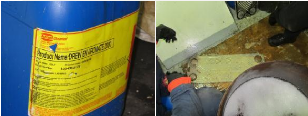
Figure 4. Left: Drew Enviromate 2000 - multipurpose cleaning. Right: Plate is brushed to remove deposits.