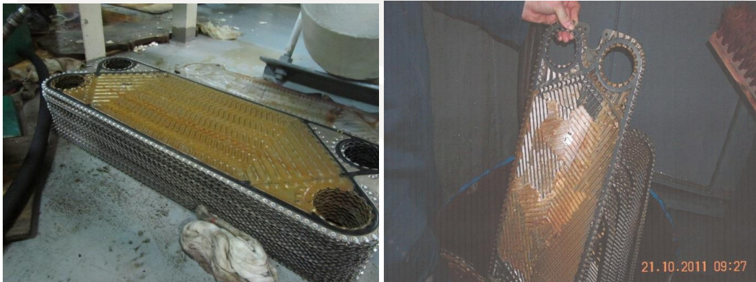
Figure 10. Left: December 2012 - before installation, plates are covered with slime. Right: FWG plates (different FWG unit) treated with chemicals but covered with lime scale and slime.