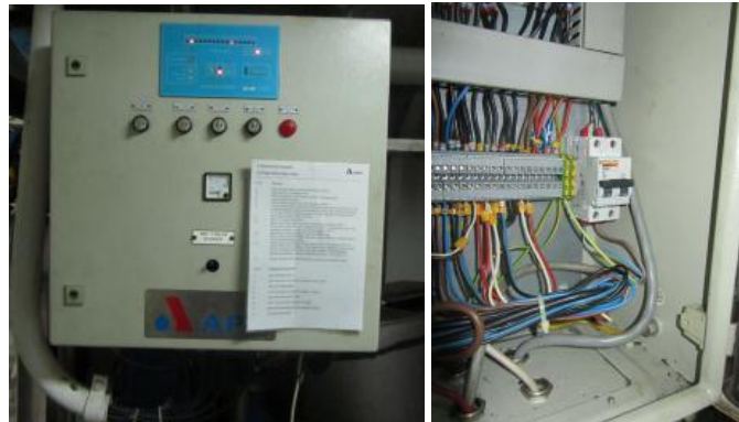
Figure 7. FWG main power cabinet and cable connection.