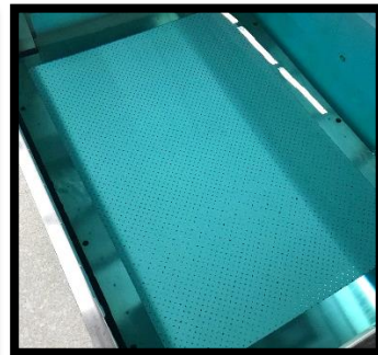
After - Pool with blue hue

We have been very impressed by the results of the HydroFLOW water conditioning devices in our facility and highly recommend them for pool applications.