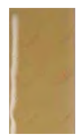
Baseline measurement with 100% biocide (Under 1,000 CFU) Biocide chemicals kept CFU levels at a minimum

Blow down was reduced by 50% and total bacteria counts continued to be minimal, while the efficiency of chillers was maintained. The reduction in chemicals and blow down led to an ROI of 1 year.