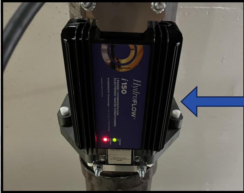
Installed HydroFLOW i150 Unit

In June 2022, a HydroFLOW i150 unit was installed on the 6" line leaving the building.